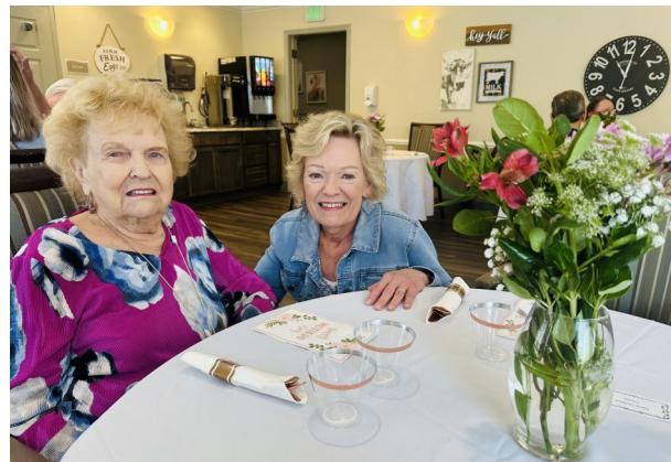
Emerald Gardens Mother's Day:

What a beautiful turn out we had for our wonderful mothers and mother figures here.